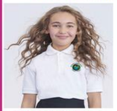
White Polo Shirt

As a parent of a young child myself I know how expensive back to school shopping can be, so I was overjoyed when Berriew C.P approached me and asking if I could offer a lower cost alternative to the traditional embroidered logos on school uniforms. All our uniforms have the logo added using DTF technology which means that you still get vibrant, long lasting school logos but at the fraction of the cost. We are also offering free personalised name tags with any order over £30