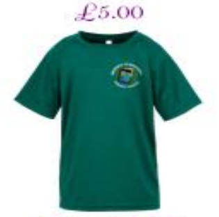
Staycool PE T-Shirt