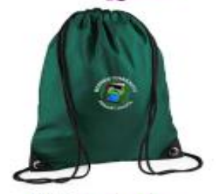
PE/Swim Bag £4.00