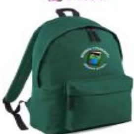
Kids Rucksack 38 x 28 x 19 cm